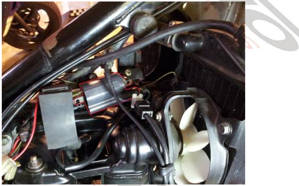
location of the ignition coil, under the fuel tank.

- Since this is a TCI ignition coil, one side has to be attached to 12 Volt. You can do this by attaching the red wire to the + pole of the battery. Then attach the other side of the wire to the pin of the TCI ignition coil with a " + " sign next to it.