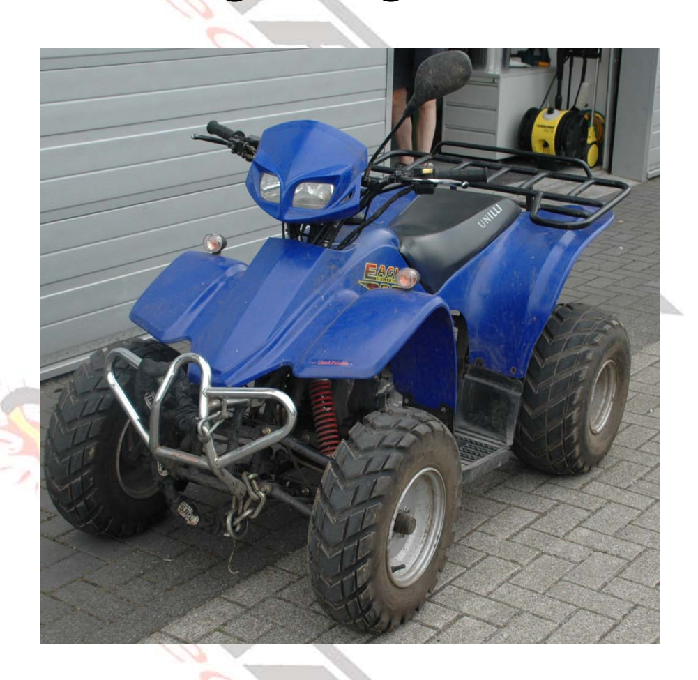
Unilli Motor Eagle